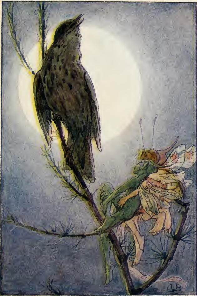
"A thrush sang it to me one night" (p. 103).